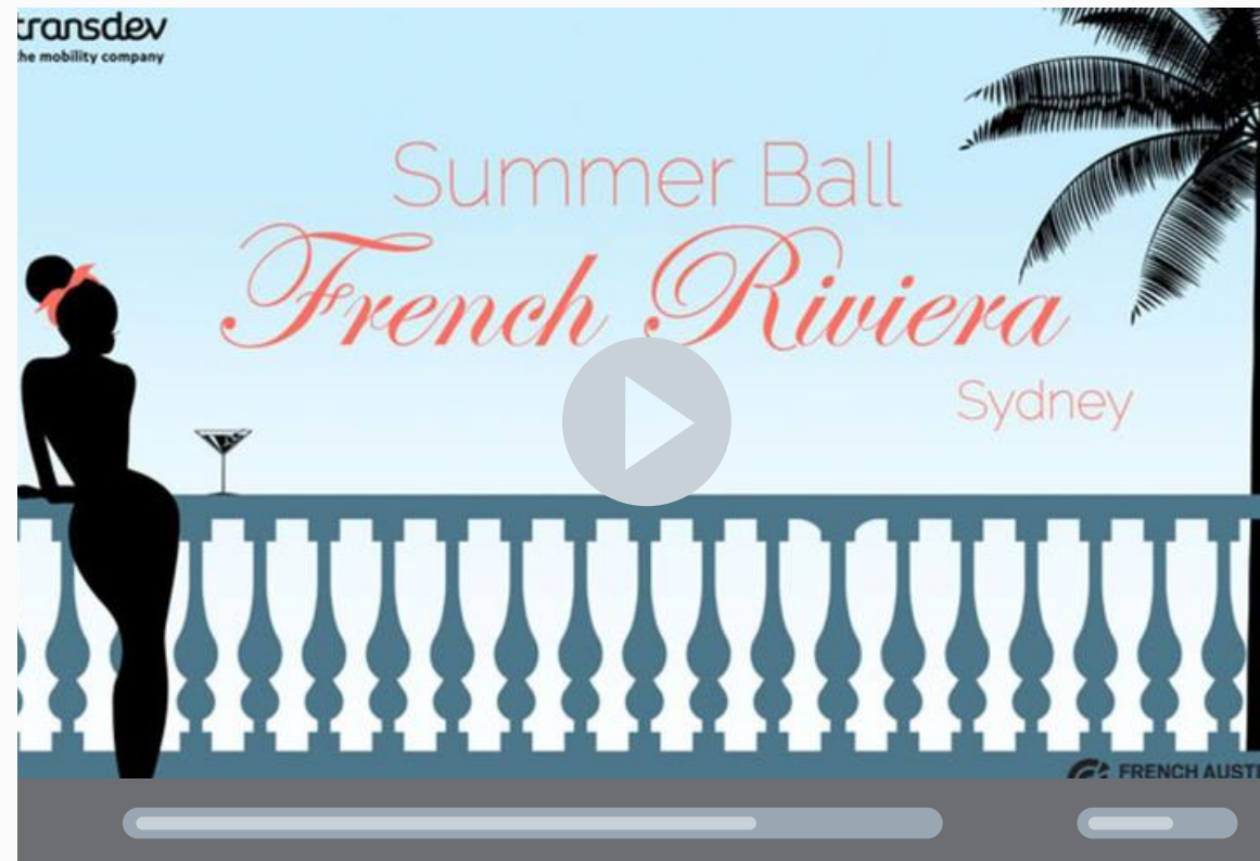
Transdev Gala - French Riviera