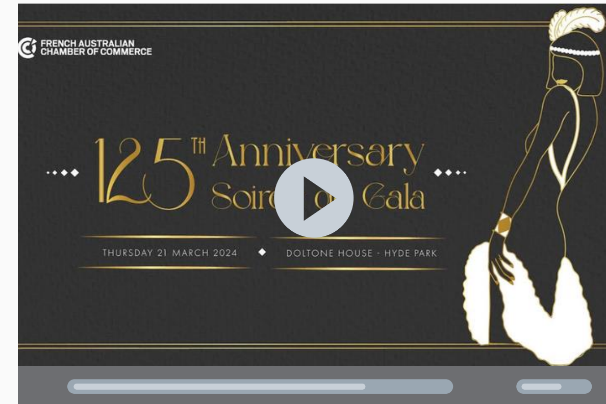
125 th Anniversary Gala - The Great Gatsby