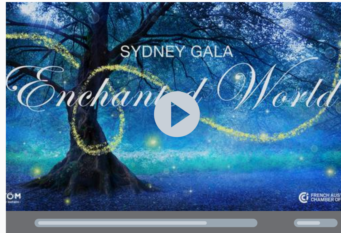
Alstom Gala - Enchanted World